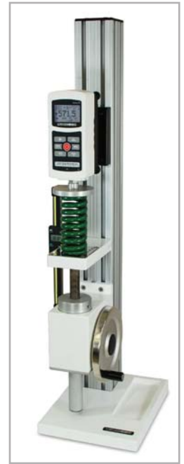
Shown with a TSF test stand in a spring testing application

The gauges' averaging mode addresses the need to record the average force over time, useful in applications such as peel testing, while external trigger mode makes switch activation testing simple and accurate. An ergonomic, reversible aluminum design allows for hand held use or test stand mounting for more sophisticated testing requirements. The force gauges are directly compatible with high capacity Mark-10 test stands, grips, and software.