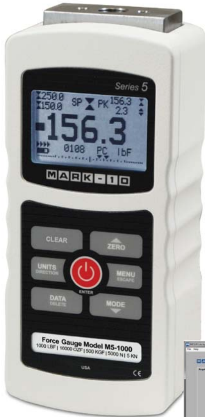
MESUR™ Lite data acquisition software is included with the gauges

The M5-750, M5-1000, M5-1500, and M5-2000 advanced digital force gauges are designed for tension and compression force testing in numerous applications across virtually every industry, with capacities up to 2,000 lbf (10,000 N). The gauges features an industry-leading sampling rate of 7,000 Hz, producing accurate results even for quick-action tests. A large, backlit graphics LCD displays large, legible characters, while the simple menu navigation allows for quick access to the gauges' many features and configurable parameters. Data can be transferred via USB, RS-232, Mitutoyo (Digimatic), or analog outputs.