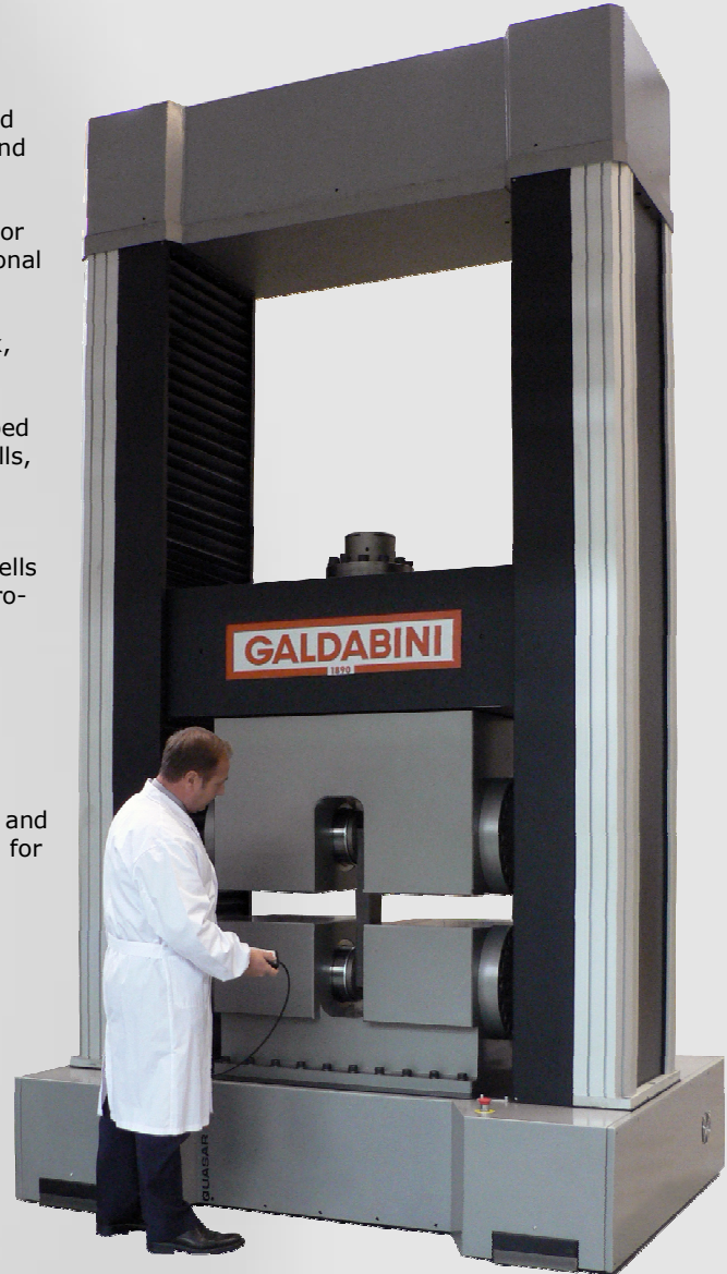
Universal testing machine Quasar 2000 with Hydraulic parallel closing grip