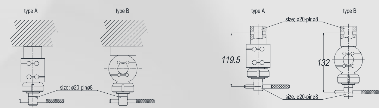
As auxiliary load cell (removable)