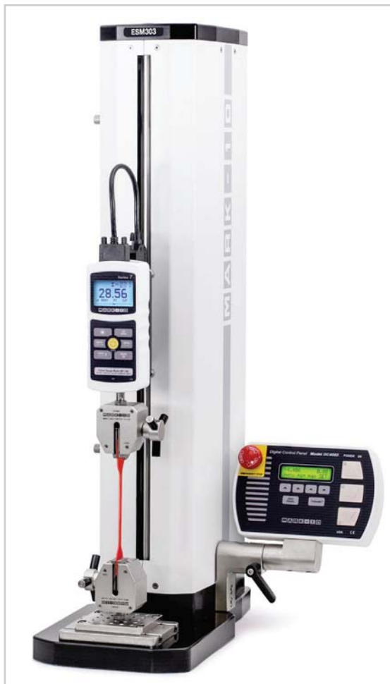
^ ESM303 is shown above configured for a tensile test, with a Series 7 force gauge and G1061-2 wedge grips.

The ESM303 is a highly configurable single-column force tester for tension and compression measurement applications up to 300 lbf [1.5 kN], with a rugged design suitable for laboratory and production environments. Sample setup and fine positioning are a breeze with available FollowMe™ force-based positioning - using your hand as your guide, push and pull on the force gauge or load cell to move the crosshead at a variable rate of speed.