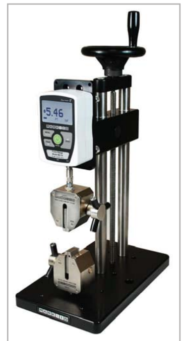
> Shown with an ES20 test stand with G1061 wedge grips