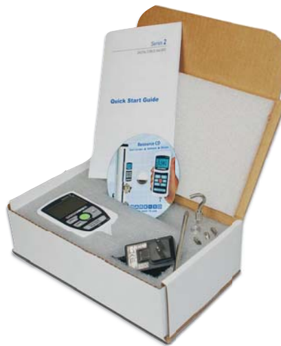
< Shown with the included cushioned shipping carton and optional accessories

The gauges are overload protected to 200% of capacity. An ergonomic, reversible aluminum housing allows for hand held use or fixture mounting, rugged enough for applications in both production and laboratory environments. Series 2 gauges are directly compatible with Mark-10 test stands and grips.