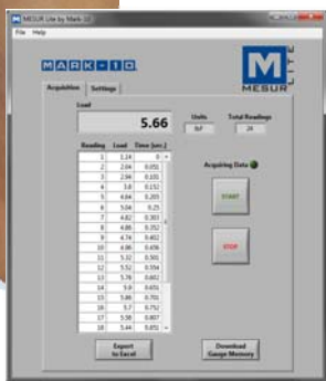
MESUR™ Lite data acquisition software is included with Series 4 gauges

Series 4 gauges include MESUR™ Lite data acquisition software. MESUR™ Lite tabulates continuous or single point data from Series 5 and 4 gauges. Data saved in the gauge's memory can also be downloaded in bulk. One-click export to Excel button easily allows for further data manipulation.