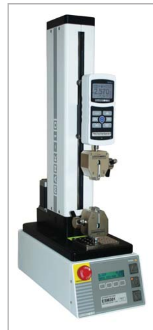
Shown with an ESM301 test stand and G1061 wedge grips

On-board data memory for up to 50 readings is included, as are statistical calculations with output to a PC. Integrated set points with indicators and outputs are ideal for pass-fail testing and for triggering external devices such as an alarm, relay, or test stand. The gauges are overload protected to 200% of capacity, and an analog load bar is shown on the display for graphical representation of applied force.